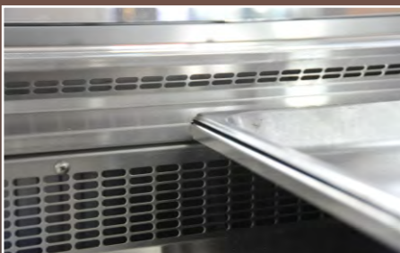
Cold air is blown under and over the produce