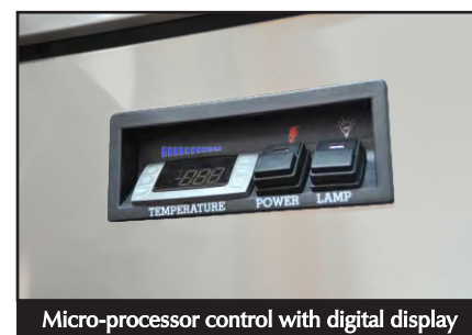
Micro-processor control with digital display

For details of your local dealer contact: