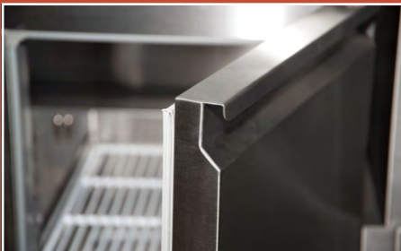
Fridge doors with easy to clean handles