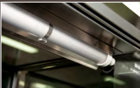
Top mounted fluorescent lighting