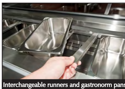
Interchangeable runners and gastronorm pans