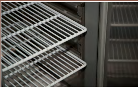
Under-bench shelving racks